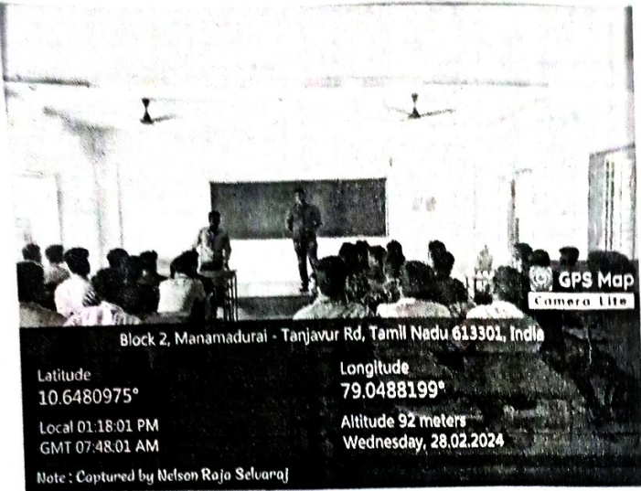
Mr.R.Rajarajeshwaran is interacting with the students on 28/02/2024 during alumni interaction