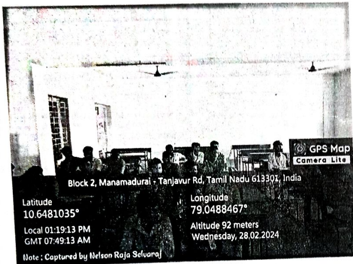
Glimpse of the program